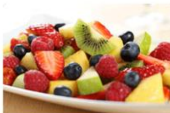
Food and Drink Payments

When you log into the system you will be presented with the usual option for food & drinks payments